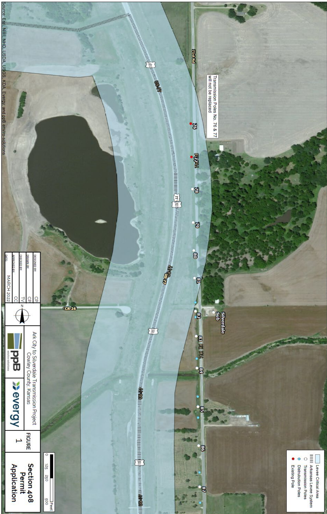
Attachment 2: Project pole locations image 1.